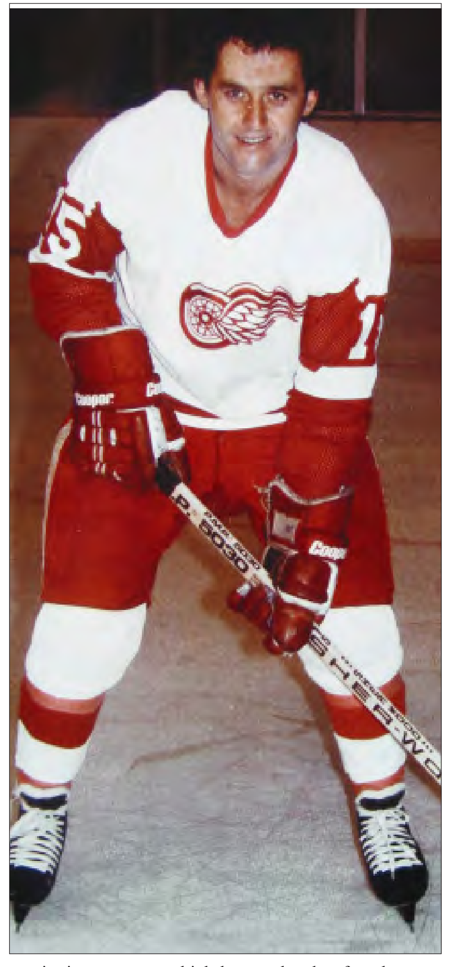
year as color analyst continuing a career which began shortly after the confor the Red Wings, clusion of his playing days in the NHL.