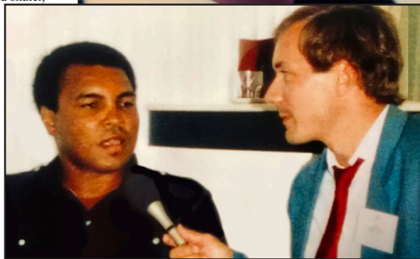
interview Ali for their documentary.

She had been in Toronto for the Toronto Film Festival.